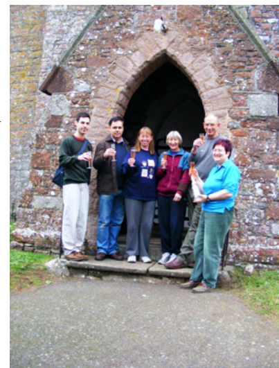
The Peal band (from left): Treble, 2, 3, 4, 5, Tenor