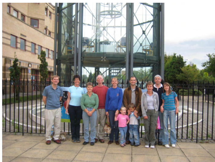
The West Wickham band outside the tower at Basildon