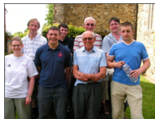
The Lewisham District Band

Despite numerous phone calls over the previous 3 months it had been impossible to find judges so