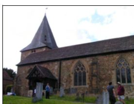
St. Mary, Westerham

On a lovely sunny day the Lewisham District achieved their best county 8 bell result for a number of years with 2nd place at the event held at Westerham on 28th