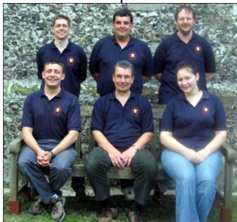
The victorious Beckenham band

weather was good so drinking tea in the churchyard or something stronger in the garden of the nearby Pied Bull was the order of the afternoon.