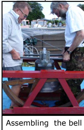
Assembling the bell