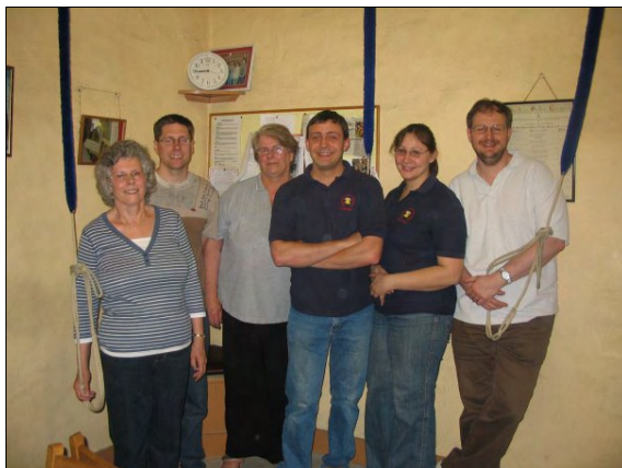
The band. Left to right: Treble to Tenor

To commemorate the 65th anniversary of the Dambusters raid.