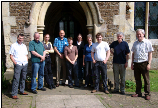
The Bromley Common Band

Sunday ringing, with no problems, aside from a seized clapper causing confusion to us all when we went from Queens to Weasels with no effort on our part. I'll leave it to you to work out which bell was affected.